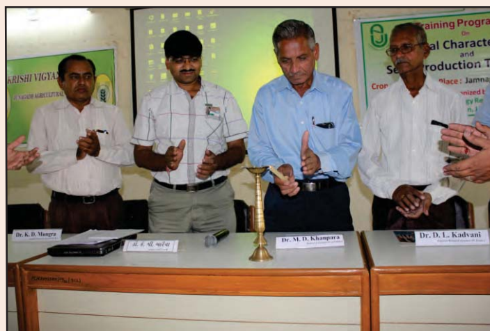
Training programme on “Varietal Characterization and Seed Production Technology in Pearl millet”

A Three day training programme on “Varietal Characterization and Seed Production Technology in Pearl millet” was organized on behalf of National Seed Project by the STR unit (NSP) of this center at Pearl Millet Research Station, JAU, Jamnagar on November 28-30, 2016. Twenty farmers of Theni District from Tamil Nadu State and four girls students of BRS College, Dumiyani- Upleta, Dist. Rajkot and three students of BRS College, Sardagram-Mangrol, Dist. Junagadh remained present in this training programme. The visits of crop cafeteria, STR (NSP) laboratory, groundnut breeder seed production plot, pearl millet hybrid seed production plot, field experiments, seed storage entomology experiments were arranged during the training.