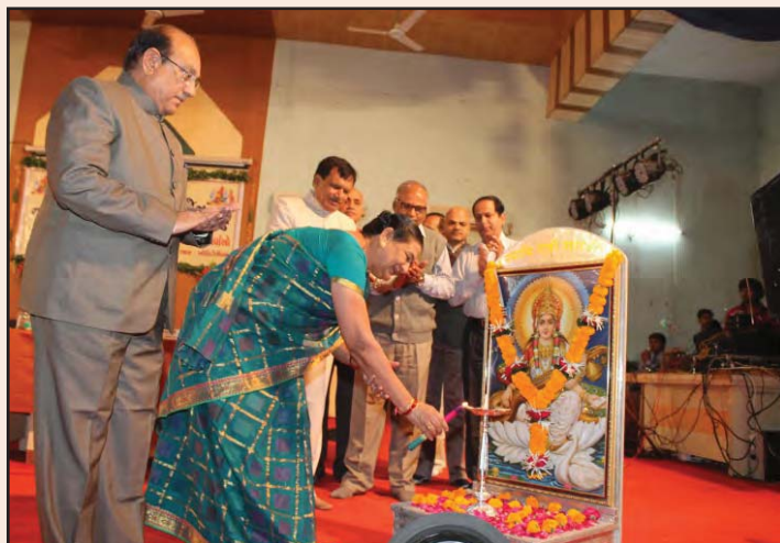
Inauguration of Inter Agricultural University cultural and literary competitions