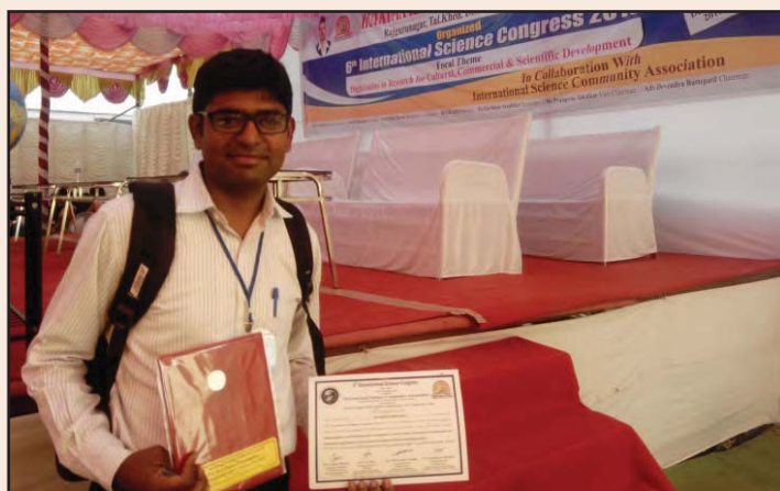
International Young Scientist Award