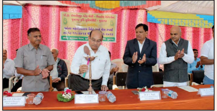
Inauguration of Inter College Cricket and Chess Tournaments