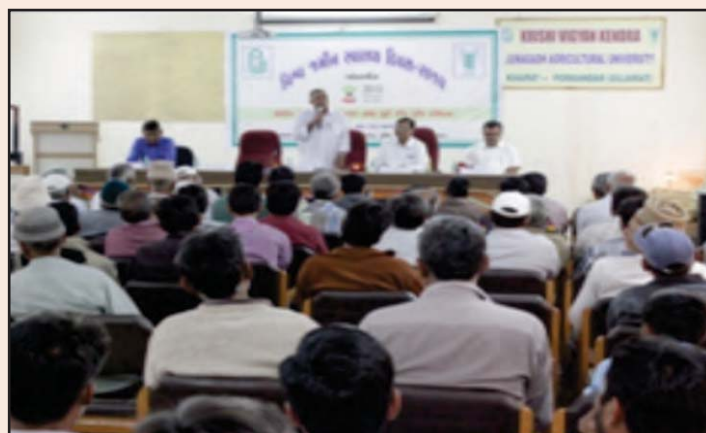
Celebration of World Soil Health Day at KVK, Khapat