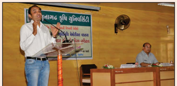
A special lecture on "Bharat Ratna Sardar Patel. An Infrequent Personality"