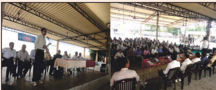
Celebration of “National Seed Day”