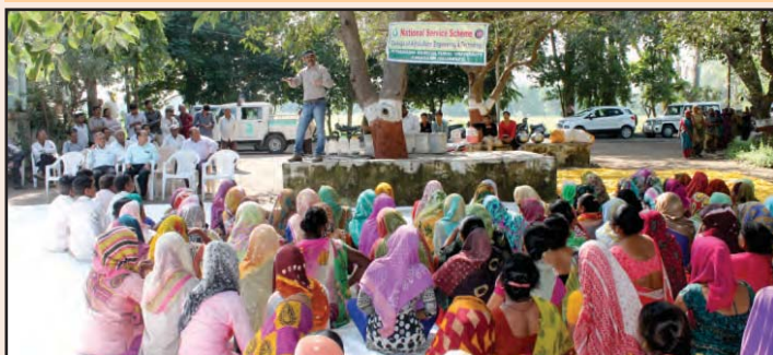
A demonstration programme on Snakes' hang on was conducted at Sagdividi Farm, JAU, Junagadh on October 14, 2016 by the co-operation of Sakkar Baug Zoo, Junagadh