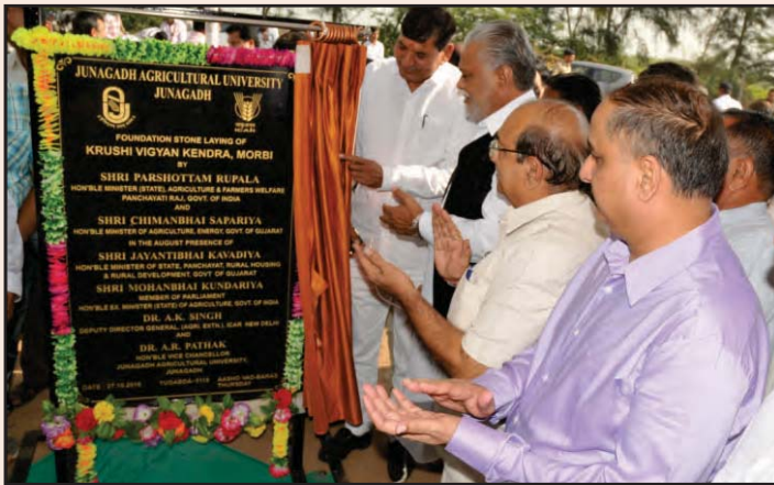
Foundation Stone laying of KVK, Morbi

Foundation Stone laying of KVK, Morbi was done on October 27, 2016 by Shri Parshottam Rupala, Hon'ble Minister (State), Agriculture & farmers Welfare Panchayati Raj, Government of India, New Delhi and Shri Chimanbhai Sapariya, Hon'ble Minister of Agriculture & Energy, Government of Gujarat, Gandhinagar in the auspicious presence of Shri Jayantibhai Kavadiya, Hon'ble Minister of State, Panchayat, Rural Housing and Rural Development, Government of Gujarat, Gandhinagar; Shri Mohanbhai Kundariya, Ex. Minister of (State) of Agriculture, Government of India, New Delhi; Dr. A. K. Singh, Deputy Director General (Agril. Ext.), ICAR, New Delhi; and Dr. A. R. Pathak, Hon'ble Vice Chancellor, JAU, Junagadh.