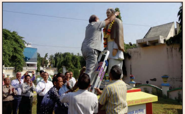
Floral tribute to Bharat Ratna Shri Sardar Vallabhbhai Patel