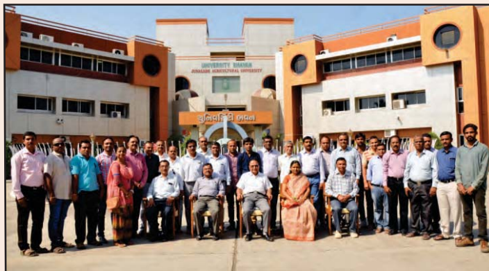
Training programme on “Training Methods for Trainers of Extension Institutes”

Three day training programme on “Training Methods for Trainers of Extension Institutes” was organized by the Directorate of Extension Education during October 17-20, 2016 in collaboration with National Institute of Agricultural Extension Management and JAU, Junagadh, wherein 25 officers participated in the training. During the training, 17 lectures on various extension teaching methods and AV aids were delivered by the experts.