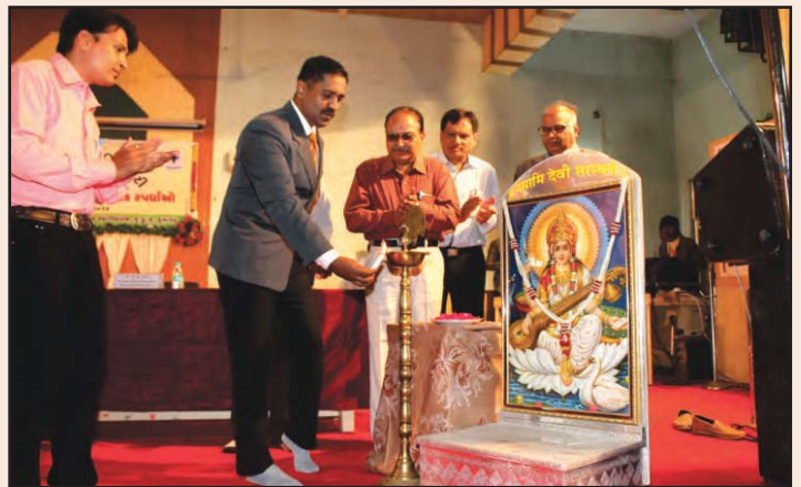
Inauguration of Inter college cultural competition