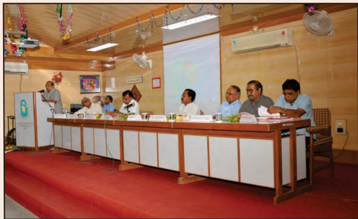
25 th ZREAC Meeting

congratulated the scientists on recommendations and for proposing new technical programmes relating to needs. In this meeting, one variety of castor GJCH 8, 14 recommendations for farmers, 10 recommendations for scientific community and 33 new technical programmes were approved by the house for rabi-summer season for South Saurashtra region after healthy discussion.