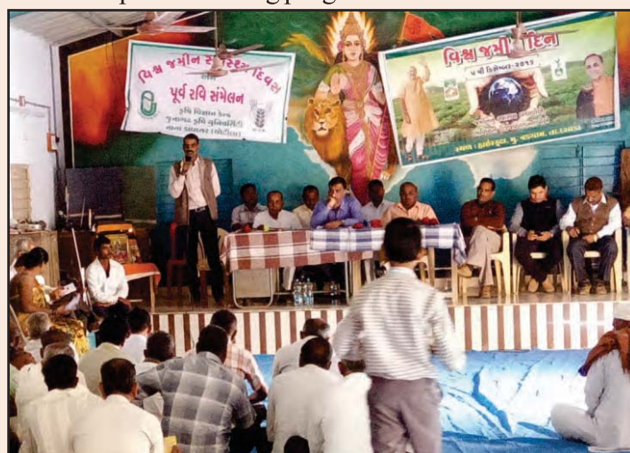
Special Programme of "World Soil Health Day"