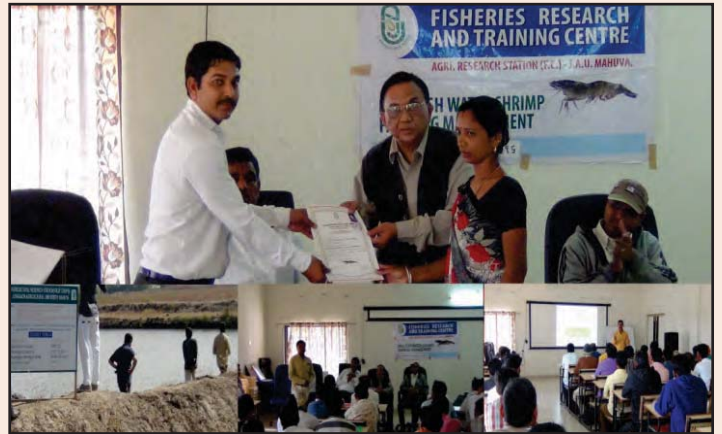
Training on Brackish-Water Shrimp Farming management

Eighth training on "Brackish-Water Shrimp Farming management" was organized by Fisheries Research & Training Centre, JAU, Mahuva from November 28-December 02, 2016, wherein 50 participants from various part of Saurashtra participated. This was unique shrimp training programme where they came to know how the shrimp behave and respond to the artificial environment.