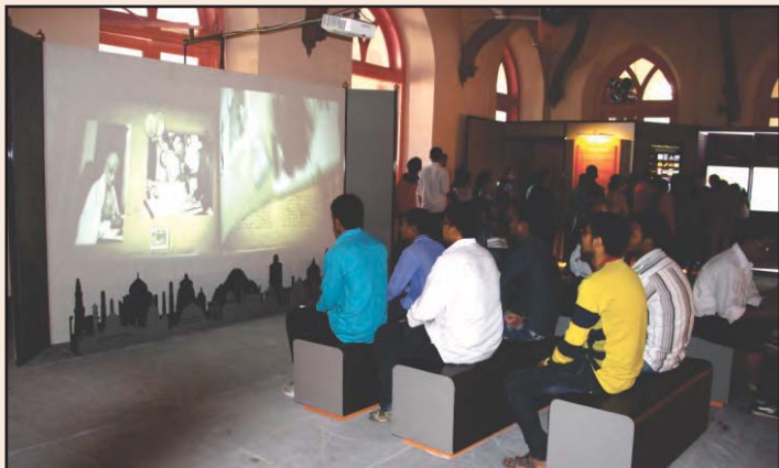
Visit of Sardar Patel Museum by students at SSK

A programme to showcase the "role of Sardar Patel in consolidation of previous states" was arranged on November 4, 2016 at museum at Sardar Smruti Kendra. This programme was attended by 300 people including University officers, Deans, staff members and students.