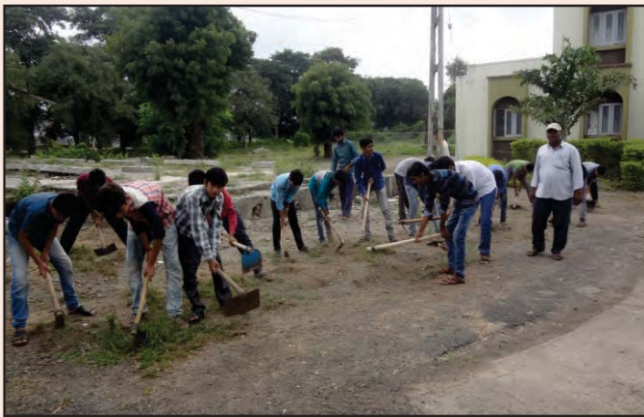
Shramyagna campaign by the students on the occasion of Gandhi Jayanti