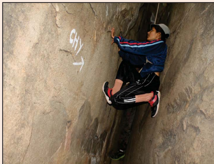
Participation in Basic Rock Climbing Camp

One hundred and six students of JAU enthusiastically participated in Basic Rock Climbing Camp organized by Pandit Dindyal Upadhyay State Mountaineering Institute, Girnar, Junagadh during November 15-24, 2016.