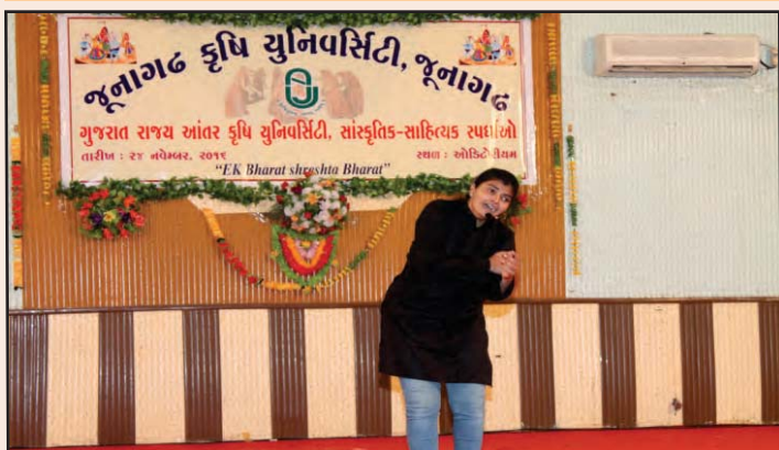
The theme of "Ek Bharat Shreshtha Bharat" incorporated in Gujarat State Inter Agricultural University Cultural & Literary Competitions