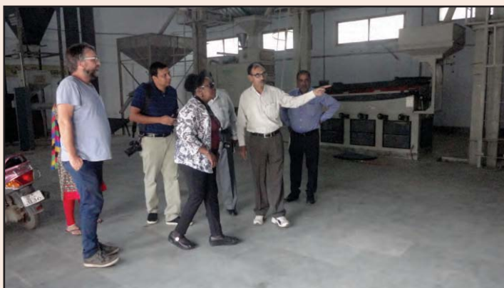
Scientists from Florida Agricultural and Mechanical University (FAMU) visited "Seed Processing Plant" on October 17, 2016