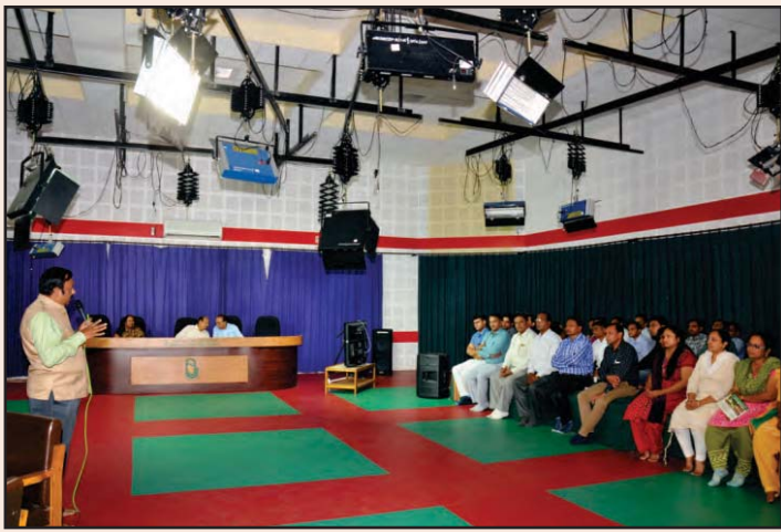
Training programme on "Community Radio for Agricultural Development"