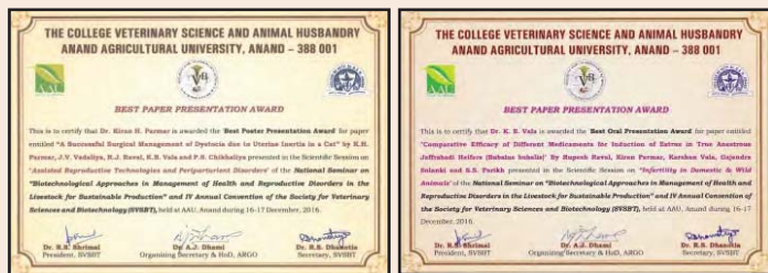
Best oral presentation award