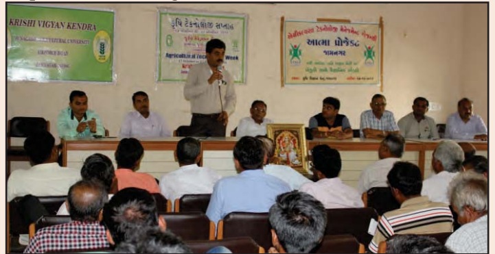
Celebration of Agriculture Technology Week at KVK, Jamnagar

KVK, JAU, Jamnagar celebrated technology week during October 17-21, 2016, in which 575 farmers including farm women participated. During this week, special emphasis was given on the management of pink boll worm in cotton and white grub in groundnut and other kharif crops. They also encouraged for organic farming as well as reduction of cost of cultivation with improved technologies.