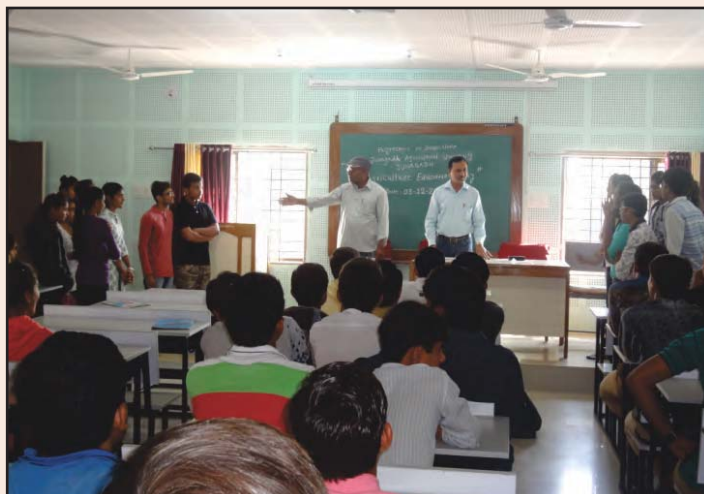
Celebration of Agricultural Education Day at Polytechnic in Horticulture, JAU, Junagadh

Similar, Agricultural Education Day was celebrated by Polytechnic in Horticulture, JAU, Junagadh, Polytechnic in Agriculture, Dhari and Polytechnic in Agril. Engineering, JAU, Targhadiya (Rajkot). In this celebration, various activities viz. , Lecture on Dr. Rajendra Prasad, First President of India, essay competition, painting competition, interaction within students, visit to farmers' fields, agril. museum and Laboratories as well as debate on use of mobile phone, importance of health, etc., were carried out by students.