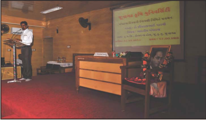
A special lecture on “Draft of Our Constitution and Its Division, Schedules and Articles”