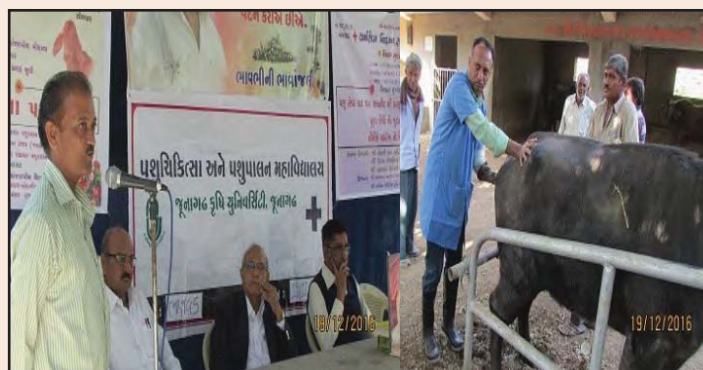
Inaugural function of clinical camp at Bhanvad

A special Veterinary Clinical Camp was organized by Bhanvad Mahajan Panjarapol Gaushala, Bhanvad in collaboration with CoVS&AH, JAU, Junagadh and Animal Husbandry of Jamnagar district on December 19, 2016 at Bhanvad. Camp was sponsored by Late. Shree Dhansukhbhai Mehta parivar. During the camp, 151 animals were treated for different medical, surgical and gynaecological ailments. Additionally, 100 animals were dewormed with antihelmetic and 700 animals were vaccinated.