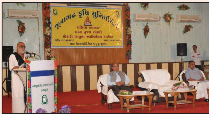
Well-known Kathakar Sant Mahatma Morari Bapu addressed and gave his kind blessings to the faculties of JAU, Junagadh on October 16, 2016