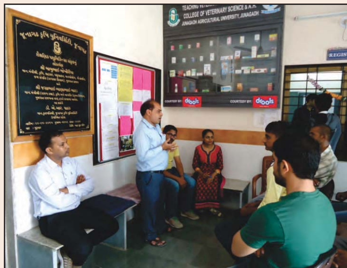
Celebration of Agricultural Education Day at CoVS&AH

Agricultural Education Day was celebrated on December 3, 2016 on the occasion of Birth anniversary of Bharat Ratna, Dr. Rajendra Prasad the first Union Minister of Agriculture of India in 1946 and first President of Independent India at CoVS&AH, Junagadh Polytechnic in Horticulture, JAU, Junagadh, Polytechnic in agriculture, Dhari and polytechnic in Agricultural Engg. Targhadiya. In this programme special lectures on Agricultural for farmers, essay, debate and painting competition etc. were arranged.