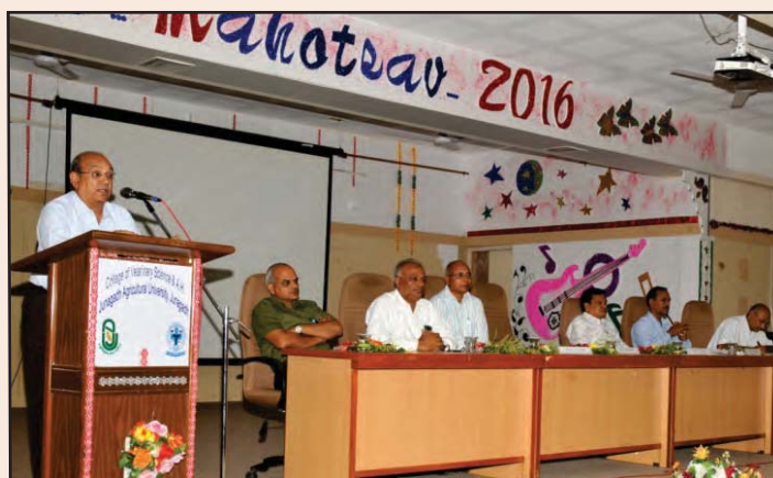
Vibrant Gujarat Start Up Programme- 2016