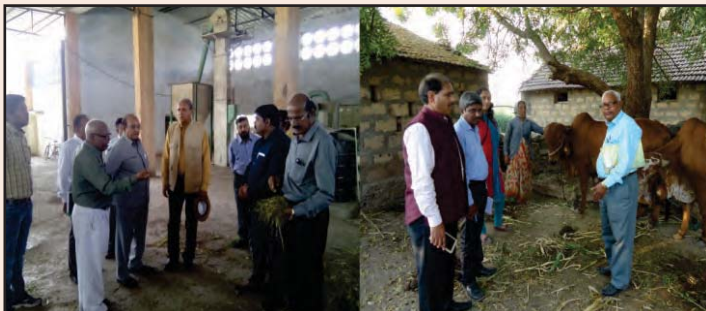
Cattle Breeding Farm Visit