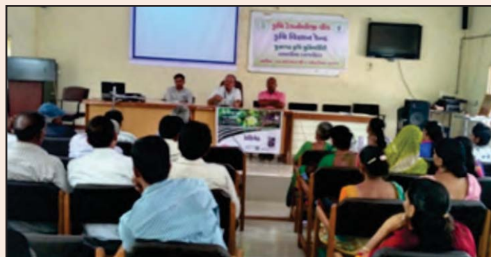
Celebration of Technology Week (27 September – 1 October) at KVK, Targhadia