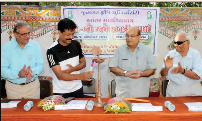
Inauguration of Inter College Kabaddi and Kho-Kho tournaments